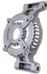
21-82163 DE Housing