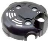
46-82285 SRE Cover

For: Toyota DIM: 128.5mm OD Replaces: OE: 104211-3761 Lester: 21247 Ref: Note: