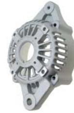
21-82165 DE Housing