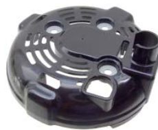
46-82261 SRE Cover

For: Ford Truck DIM: 138mm OD Replaces: OE: 104210-649, 104210-692 Lester: 11620, 44005 Ref: Note: