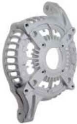
21-82160 DE Housing