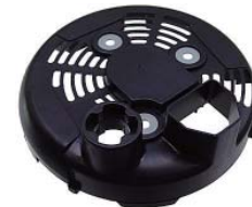
46-82283 SRE Cover

For: Ford, Land Rover, DIM: 128.5mm OD Replaces: OE: 104210-3700, 104210-3701, 104210-4090, 104210-4091, 1042104090, 1042104091 Lester: 11205, 11238 Ref: Note: