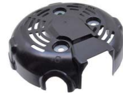
46-82281 SRE Cover

For: DIM: 128.5mm OD Replaces: OE: 104210-1960, 104210-1961, 104210-1962 Lester: 11682, 14883 Ref: Note: