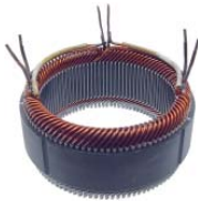
27-82022H27 Stator-Modify 270 Amp, 128.5mm OD

Note: used on Denso PowerEdge Class 8 Truck. 6 Leads/6 Dot/2 Layer