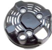
46-82262 SRE Cover

For: DIM: 138mm OD Replaces: OE: Lester: Ref: Note: