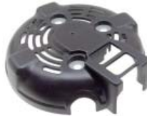
46-82280 SRE Cover

For: Toyota DIM: 128.5mm OD Replaces: OE: 104211-3770 Lester: 21017 Ref: Note: