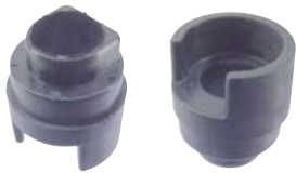
42-82080 Insulator B+ Terminal-for Top D Shape Interlock M8 Post

Dim: 14.39mm ID, 26.78mm OD 29.91mm H, 26.7mm Hole