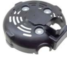
46-82260 SRE Cover

For: DIM: 138mm OD Replaces: OE: 421000-713 Lester: 11793, 14027 Ref: Note: