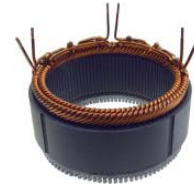
27-82029-1 Stator 220 Amp, 138mm OD

Note: This is High Output Stator, special winding.