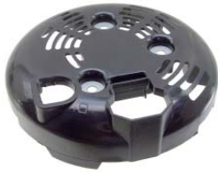
46-82265 SRE Cover

For: Ford DIM: 138mm OD Replaces: OE: 104210-656, 104210-657; 104211-030, 104211-031 Lester: 11664, 11665 Ref: Note: Insulator use 42-82092