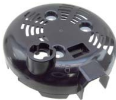
46-82267 SRE Cover

For: Chevy DIM: 138mm OD Replaces: OE: 104210-6010 Lester: 11251 Ref: Note: