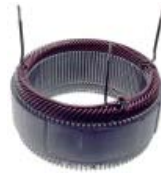
27-82031 Stator 80 Amp, 128.5mm OD

Note: This is High Output Stator, special winding.