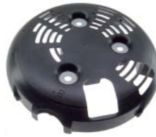
46-82251 SRE Cover

For: DIM: 138mm OD Replaces: OE: Lester: Ref: Note: