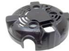
46-82282 SRE Cover

For: Cadillac DIM: 138mm OD Replaces: OE: 104211-0671 Lester: Ref: Note: