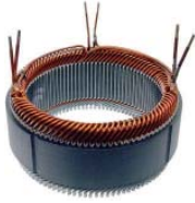
27-82022H22 Stator-Modify 220 Amp, 128.5mm OD