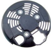
46-82248 SRE Cover

For: DIM: 138mm OD Replaces: OE: Lester: Ref: Note: