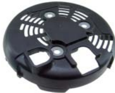
46-82249 SRE Cover

For: Buick DIM: 128mm OD Replaces: OE: 104210-2250 Lester: 11367 Ref: Note: