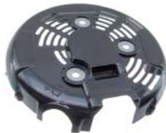
46-82250 SRE Cover

For: Buick DIM: 128mm OD Replaces: OE: 104210-436 Lester: 11180 Ref: Note: 11mm B+ Hole Height. Similar to 46-82231, but 46-82231 is 15mm Height.