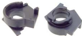
42-82090 Insulator B+ Terminal-for Top M8 Post