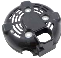
46-82276 SRE Cover

For: Toyota DIM: 128.5mm OD Replaces: OE: 104211-3310, 104211-3311, 104211-3312, 104211-3290, 104211-3291, 104211-3293, 104211-3301, 104211-3303, 104211-3541, Lester: 11776, 11777, 14486, 14487 Ref: Note: