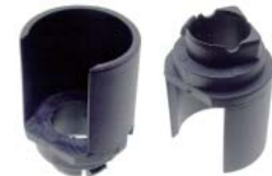
42-82099 Insulator B+ Terminal-for Top D Shape Interlock M8 Post