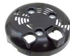
46-82264 SRE Cover

For: Fiat DIM: 128mm OD Replaces: OE: 104210-1750, 104211-8000 Lester: 11585, 11594 Ref: Note: