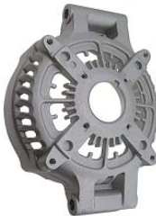
21-82161 DE Housing