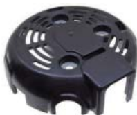
46-82286 SRE Cover

For: Alfa Romeo DIM: 128.5mm OD Replaces: OE: 104211-8660 Lester: 21184 Ref: Note: