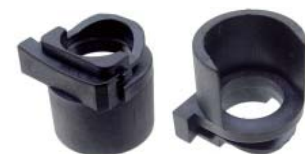
42-82100 Insulator B+ Terminal-for Side M8 Post