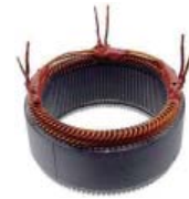
27-82026AH25 Stator-Modify 250 Amp, 120mm OD