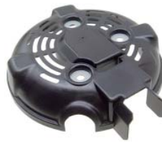
46-82268 SRE Cover

For: Ford DIM: 138mm OD Replaces: OE: 104210-656, 104210-657; 104211-030, 104211-031 Lester: 11664, 11665 Ref: Note: Insulator use 42-82092