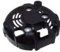
46-82287 SRE Cover

For: Hyundai, kia DIM: 128.5mm OD Replaces: OE: 104211-8790 Lester: 11953 Ref: Note: Similar to 46-82194 but not the same, while 46-82194 used on LEster 13979. 46-82284 used on Lester 11953.