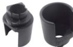
42-82096 Insulator B+ Terminal-for Top M8 Post