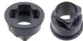
42-82098 Insulator B+ Terminal-for Top D Shape Interlock M8 Post

Note: with 2 slit, used with 46-82265 SRE Cover.