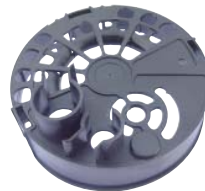
46-82269 SRE Cover

For: Buick, Cadillac, Chevy DIM: 128mm OD Replaces: OE: 104210-1900, 104210-1901, 104210-1960, 104210-1961, 104210-1962, Lester: 11681, 11682, 11780, 11795, 14883 Ref: Note: