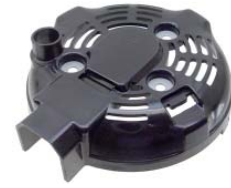
46-82263 SRE Cover

For: DIM: mm OD Replaces: OE: Lester: Ref: Note: