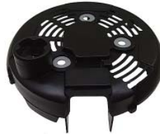
46-82279 SRE Cover

For: Land Rover DIM: 128.5mm OD Replaces: OE: 104210-1470 Lester: 11509 Ref: Note: