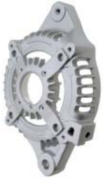
21-82152 DE Housing