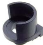
42-82094 Insulator B+ Terminal-for Side D Shape Interlock M8 Post