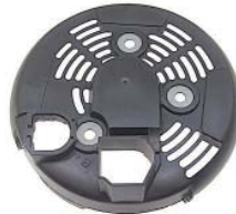
46-82288 SRE Cover

For: Cadillac, Saab DIM: 128.5mm OD Replaces: OE: 104210-2170 Lester: 11499, 11507 Ref: Note: