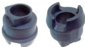
42-82091 Insulator B+ Terminal-for Top D Shape Interlock M8 Post

Dim: 14mm ID x 24.75mm OD (middle) x 25.8mm OAL