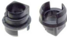
42-82092 Insulator B+ Terminal-for Top D Shape Interlock M8 Post