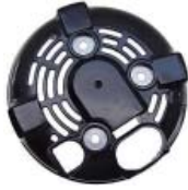
46-82284 SRE Cover

For: Hyundai, kia DIM: 128.5mm OD Replaces: OE: 104211-8790 Lester: 11953 Ref: Note: Similar to 46-82194 but not the same, while 46-82194 used on LEster 13979. 46-82284 used on Lester 11953.