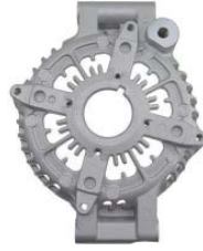
21-82162 DE Housing