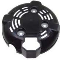
46-82275 SRE Cover

For: Ford Mustang DIM: 128.5mm OD Replaces: OE: 104210-2920, 104210-2940, 104210-2941, 104210-2942, 104210-2950, 104211-1450, TN104211-1450 Lester: 11625, 11626, 11628, 11759 Ref: Note: