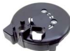
46-82289 SRE Cover

For: Honda DIM: 128.5mm OD Replaces: OE: 104210-1540, 104211-3470, 104211-3910, 104211-3960 Lester: 11930, 11931, 21154 Ref: Note: