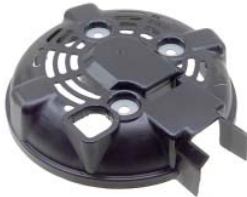
46-82266 SRE Cover

For: Land Rover DIM: 138mm OD Replaces: OE: 104210-6420 Lester: 11762, 14106 Ref: Note: