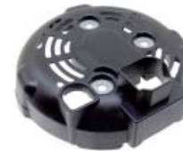
46-82291 SRE Cover

For: Land Rover, Discovery DIM: 138.5mm OD Replaces: OE: 104210-648, 104210-6480, 104210-6481, 104210-6482, 104210-6483 Lester: 21032 Ref: Note: