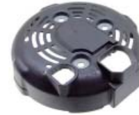
46-82290 SRE Cover

For: DIM: 128.5mm OD Replaces: OE: 104211-8380 Lester: Ref: Note: